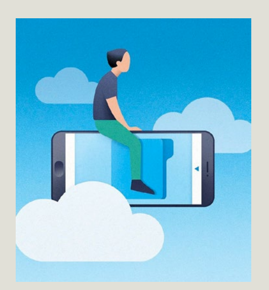
Effective data sharing also benefits the Swiss Abroad. DPSS illustration

The Digital Public Services Switzerland joint strategy for 2024 to 2027 is another milestone that I wish to mention. It was ap-