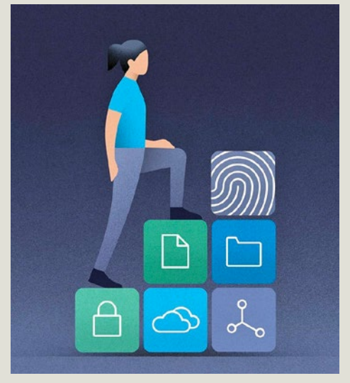
The DPSS agenda will help to accelerate the provision of much-needed infrastructure and basic services while significantly driving the development of digital public services in Switzerland. DPSS illustration

proved at the end of 2023 by the Federal Council, the cantons, the Association of Swiss Communes, and the Swiss Association of Cities. The strategy came into force on 1 January 2024, providing authorities at all federal levels with a roadmap to drive the development of digital public services in a coordinated, targeted manner.